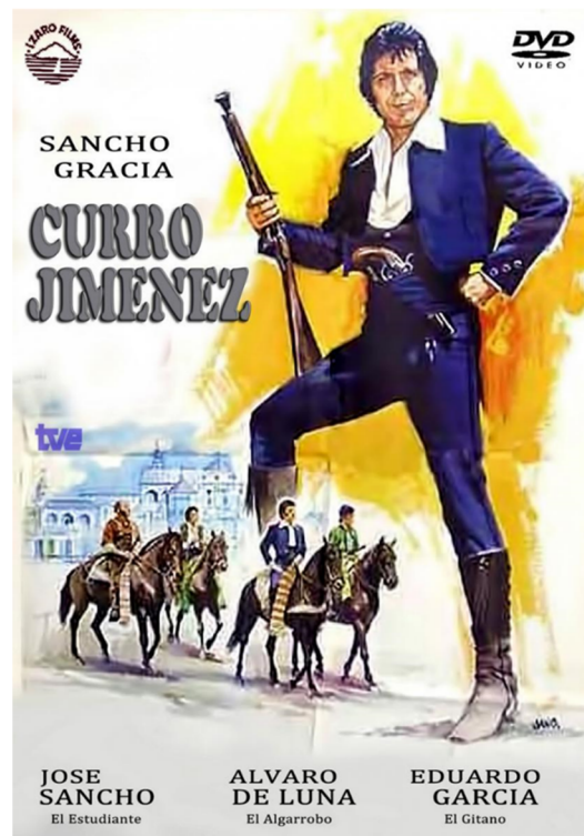
Figure 4. Promotional poster for the RTVE series Curro Jiménez (1976-1979).