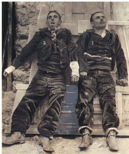
Figure 2. Photograph of anonymous authorship showing the corpses of the famous bandit Francisco Ríos González, 'El Pernaless', on the right and marked with the number 1, and Antonio Jiménez Rodríguez, 'El Niño del Arahal'. The image was commissioned by the Guardia Civil after both were shot dead in Villaverde de Guadalimar (Albacete), in order to document and publicise the demise of one of the "most wanted" bandits in Spain at the time.

These sustained intellectual dysfunctions, which are not usually questioned in public debate or in artistic and cinematographic works - as is also the case with threats such as presentism and revisionism - must be addressed in order to understand, in their