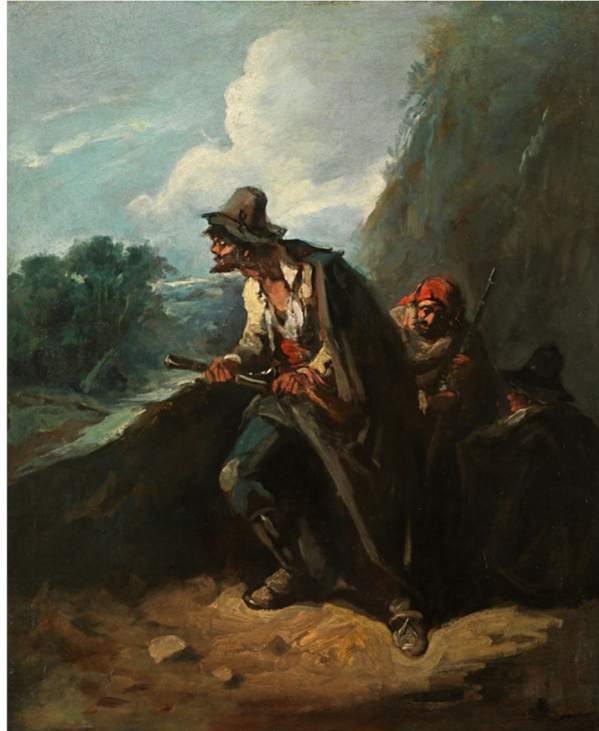
Figure 3. Oil painting by Eugenio Lucas Velázquez entitled Bandoleros (circa 1860), in the Museo Nacional del Prado (Madrid).

A high degree of rurality, poor infrastructure, low demography and the consequent endemic lack of significant population centres made a decisive contribution to the genesis of banditry and brigandage in these pre-industrial contexts. Also, the predominance of a system of agricultural exploitation based on the lord and the serfs, which induces the presence of a floating - and migrating - population of day labourers and low-skilled employees. In turn, the rugged, rough terrain is of great importance, whose roads and paths are scarce and deficient, which facilitates ambushes, flight and subsequent concealment. Last but not least, some important trade routes are poorly monitored, controlled and/or regulated due to poor - often dysfunctional for socio-political reasons - administrative, judicial, technological and "police" control of the territory. Conditions that, in general, were the norm throughout the Peninsula - not only in Andalusia, although the Andalusian bandit 1 was the most popular and common - from the Early Middle Ages and practically until the end of the 19th century (Bernaldo de Quirós, 1912; Rivas Gómez, 1977; Salas Auséns, 1989; Martín Polo, 2016).