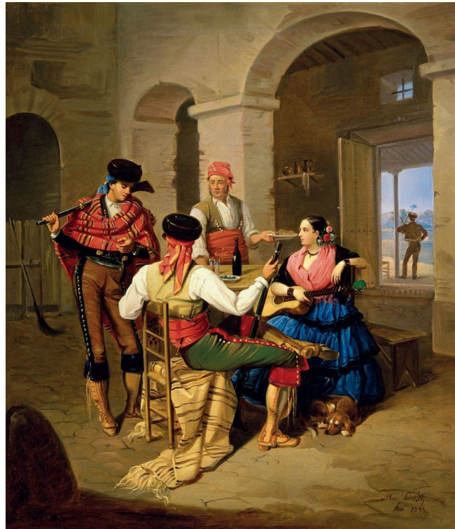
Figure 1. Scene of a Sale (1855), oil painting by Manuel Cabral and Aguado Bejarano (Museo Carmen Thyssen, Málaga).

The question, accepting that these idealised beliefs about certain criminal activities could be true from an anthropological and even historiographical approach, of course, lies in asking the role this perspective gives to the actions of law enforcement officers. For when historical approaches that analyse human activity as a simple linear story of "good guys" and "bad guys" is accepted without criticism, such confrontational logic immediately gives rise to extravagant theses. For example: if the bandit is "the good guy", then the one who pursues him, as an agent of the oppressive power that seeks to crush the helpless plebs from whom he emerges, cannot be anything other than "the bad guy". This turns the problem into a labyrinthine and distorting issue that, ironically, transforms the advocate of such a law - basically "made for the rich" - into a prop that would inadvertently support the "villains" of the story. Thus, it is not that law enforcement officers are "bad people", but that they would inadvertently place themselves at the disposal of an evil institutional structure in the fulfilment of their duties. These are approaches which, as is to be expected, should not only be nuanced, but which, even from outside the fields of standardised scientific research, occasionally encounter more than reasonable counter-current questioning: