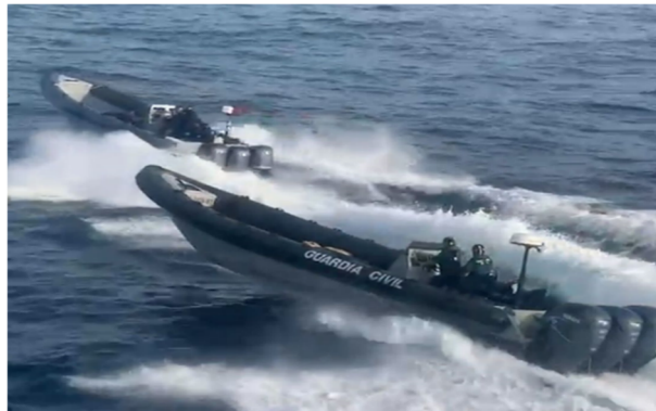
Figure 11. Archive image of a pursuit by agents of the Maritime Service of the Algeciras Command.