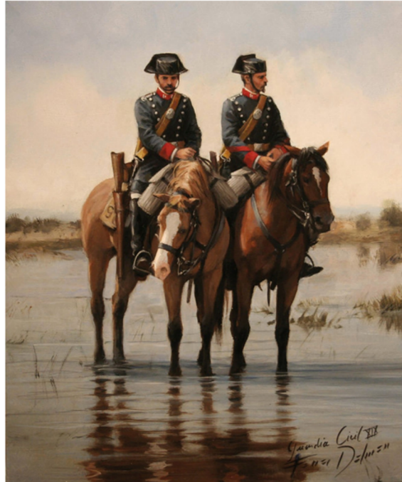
Figure 7. Pair of Guardia Civil officers on horseback in the 19th century , by Augusto Ferrer-Dalmau.

If the aim is to understand this necessary communicative strategy, it is always worth asking what fed the myths surrounding the bandit-bandido-miscreant. One cannot be satisfied with the widespread folklore of Constancio Bernaldo de Quirós (1873-1959), who, in a panegyric of the national cultural panorama that would delight tourists, fans of kitsch and supporters of ethnic determinism, equated bandits - specifically Andalusian bandits - with good chaps and bullfighters (Bernaldo de Quirós, 1912; García Benítez, 2008). These arguments would probably make perfect sense for historiographical reflection in the early 20th century, but they are unacceptable, as hackneyed and biased, from a present-day perspective as far removed as possible from psychological vagaries, while at the same time tending towards the formal analysis of concrete facts and data. The obvious manifestation of nineteenth-century banditry, which saw a temporary boom in Andalusia at the same time as it declined in the rest of the Iberian Peninsula, had its raison d'être in a panorama marked by latifundism, despotism, the proliferation of a dispossessed agricultural proletariat caste, a peculiar orography and even a declared connivance between the bandits and the local public authorities that favoured a peculiar status quo (García Casero, 1979 4 ).