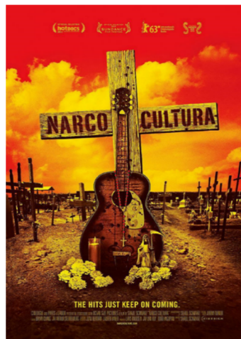
Figure 9. Poster for the US feature-length documentary Narco Cultura , about Mexico's explosive narco culture, directed by Shaul Schwarz in 2012.

the minority attitude of the young people who filmed and cheered the attack on the Guardia Civil boat which, despite being an apparently anecdotal event, collateral to the event itself, was particularly newsworthy in the media. Consequently, banditry and narcoculture may have their origins in the same sources and are therefore similar in their forms of justification, but they do not make use of the same mechanisms, nor do they pursue the same objectives, nor do they have the same power and scope. In a global context, therefore, it seems to make less and less sense to be tempted to engage in local analysis.