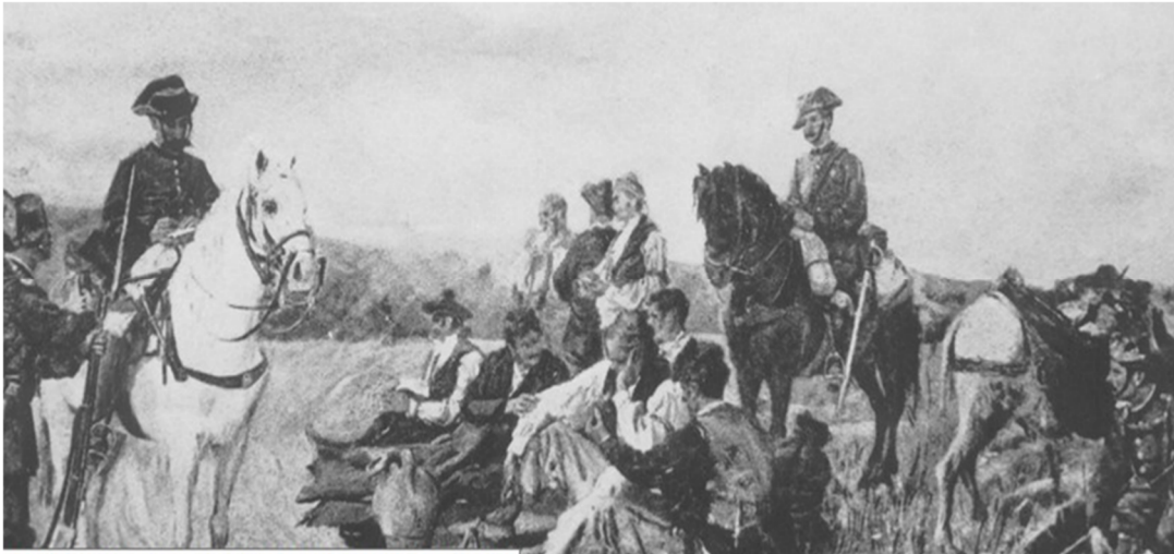
Figure 10. Close-up of the work Cambio de parejas de la Guardia Civil (1874) by Luis Franco y Salinas, which illustrates the roles of the Guardia Civil in driving prisoners and identifying people on the roads in the early years of its foundation (Museo del Prado).

While thousands of residents are demonstrating "for dignity" and "in favour of the Guardia Civil" (Nachett, 2024), expressing the mistreatment they suffer from the media and denouncing the systematic neglect of the public authorities, others - a minority, although not without a voice - have complained about what they consider "repeated police brutality" bordering on a "state of exception" ( La Voz , 2019). It is just one simple example - and not an isolated one, as many more could be found - that illustrates a point: on this issue, divided opinions on the street are the norm. This play of manifestations and counter-manifestations that enter into a singular paradox is, in reality, the effect of the internal contradictions that these cultural conflicts - traditionalism versus modernity - provoke in the daily lives of small communities in which, moreover, almost everyone knows everyone else. What is most interesting is that these protests mistakenly define themselves as "non-political" when that is precisely what they are, as social actions arising from ongoing conflicts that seek to influence several areas of political activity or, at the very least, to draw the attention of the authority in power (Lutz, 2010).