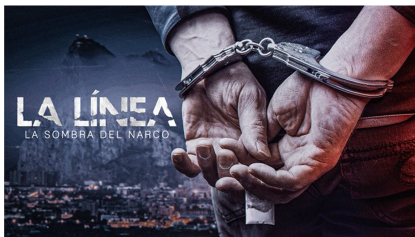
Figure 8. Promo for the documentary miniseries La Línea. Shadow of Narco , directed by Pepe Mora and distributed by Netflix (2020).

Certainly, this problem penetrates any host society through necessity. Firstly, the activity of traffickers and smugglers germinates coherently and naturally through the lack of opportunities, endemic neglect, poor education, unmet basic needs, marginalisation and, in short, it serves as a facilitator of means of survival for depressed local populations that tend to integrate these activities as a way of life, for better or for worse, to the point