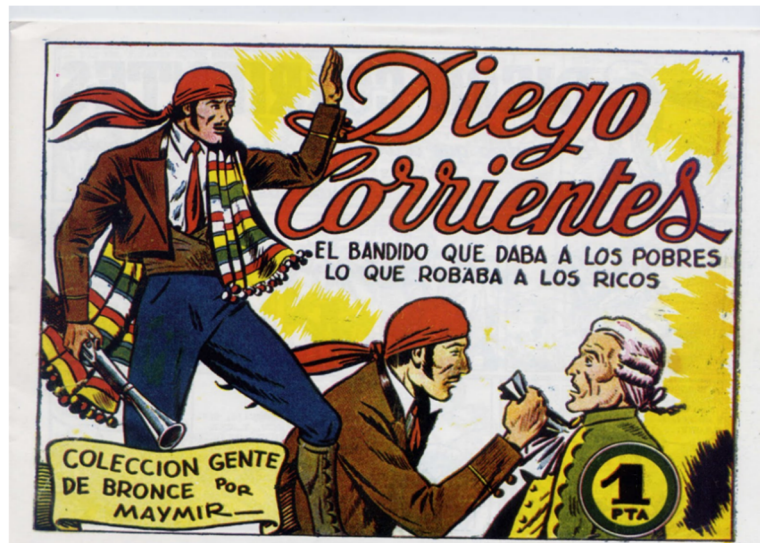
Figure 5. Cover of the comic entitled Aventuras de Diego Corrientes , from the series Gente de Bronce (Ameller Editor, Barcelona, 1950).

It is, therefore, logical that, over the years, the Guardia Civil never employed the communication strategy of using publicity about the legends about the "village bandits" that were propagated among the population to justify their successes. This would probably have provoked an unwelcome reaction among a large part of the population, since accepting such rhetoric would have meant placing oneself undesirably on the negative side of history. For this reason, concepts such as "bandit" or "banditry" were not commonly used by the distinguished for decades, with the term "malefactor" being the usual name for those who were persecuted (Núñez, 2017). This fact had an important psychosocial effect by leading part of the population spectrum, especially the emerging classes, towards always healthy doubt. But which, retroactively, could also contribute to the perpetration of the romantic myth by the most consolidated supporters of the so-called bandalero , while at the same time justifying an infinite number of highly questionable instrumentalizations of police action: The common fallacious political thesis that the fight against this kind of "evildoers" was a "war without quarter" that honest society "as a whole" maintained against those who attacked it indiscriminately, perhaps even justified dubious outrages such as the famous trials of the Andalusian Mano Negra (Sanz Agüero, 1975) (Figure 6).