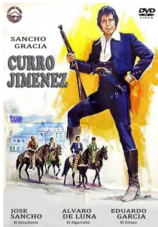
Figure 4. Promotional poster for the RTVE series Curro Jiménez (1976-1979).