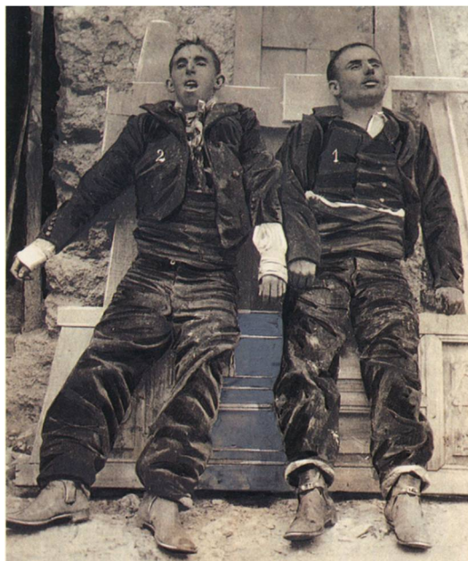
Figure 2. Photograph of anonymous authorship showing the corpses of the famous bandit Francisco Ríos González, 'El Pernaes', on the right and marked with the number 1, and Antonio Jiménez Rodríguez, 'El Niño del Arahal'. The image was commissioned by the Guardia Civil after both were shot dead in Villaverde de Guadalimar (Albacete), in order to document and publicise the demise of one of the "most wanted" bandits in Spain at the time.

These sustained intellectual dysfunctions, which are not usually questioned in public debate or in artistic and cinematographic works - as is also the case with threats such as presentism and revisionism - must be addressed in order to understand, in their