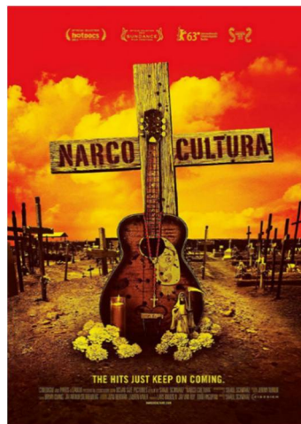
Figure 9. Poster for the US feature-length documentary Narco Cultura , about Mexico's explosive narco culture, directed by Shaul Schwarz in 2012.

the minority attitude of the young people who filmed and cheered the attack on the Guardia Civil boat which, despite being an apparently anecdotal event, collateral to the event itself, was particularly newsworthy in the media. Consequently, banditry and narcoculture may have their origins in the same sources and are therefore similar in their forms of justification, but they do not make use of the same mechanisms, nor do they pursue the same objectives, nor do they have the same power and scope. In a global context, therefore, it seems to make less and less sense to be tempted to engage in local analysis.