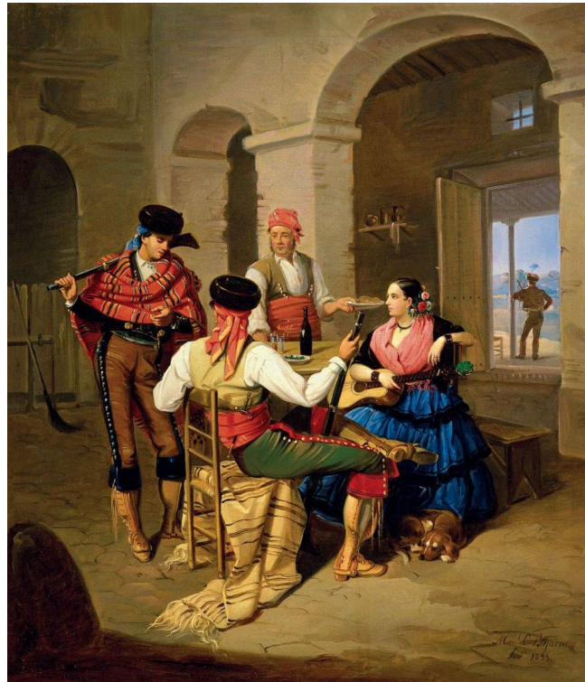
Figure 1. Scene of a Sale (1855), oil painting by Manuel Cabral and Aguado Bejarano (Museo Carmen Thyssen, Málaga).

The question, accepting that these idealised beliefs about certain criminal activities could be true from an anthropological and even historiographical approach, of course, lies in asking the role this perspective gives to the actions of law enforcement officers. For when historical approaches that analyse human activity as a simple linear story of "good guys" and "bad guys" is accepted without criticism, such confrontational logic immediately gives rise to extravagant theses. For example: if the bandit is "the good guy", then the one who pursues him, as an agent of the oppressive power that seeks to crush the helpless plebs from whom he emerges, cannot be anything other than "the bad guy". This turns the problem into a labyrinthine and distorting issue that, ironically, transforms the advocate of such a law - basically "made for the rich" - into a prop that would inadvertently support the "villains" of the story. Thus, it is not that law enforcement officers are "bad people", but that they would inadvertently place themselves at the disposal of an evil institutional structure in the fulfilment of their duties. These are approaches which, as is to be expected, should not only be nuanced, but which, even from outside the fields of standardised scientific research, occasionally encounter more than reasonable counter-current questioning: