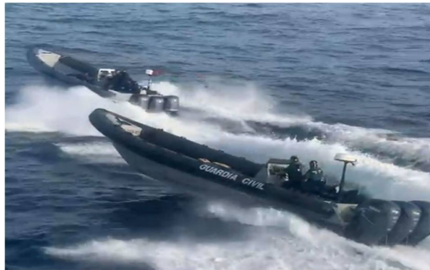
Figure 11. Archive image of a pursuit by agents of the Maritime Service of the Algeciras Command.